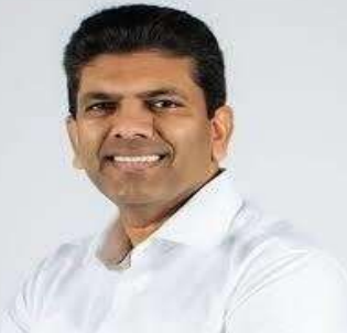
Hon'ble Minister of State Dr. Pemmasani Chandrasekhar