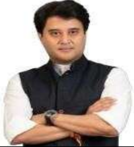
Hon'ble Union Minister Shri Jyotiraditya M. Scindia