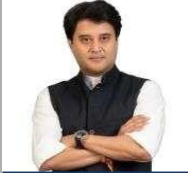
Hon'ble Union Minister Shri Jyotiraditya M. Scindia