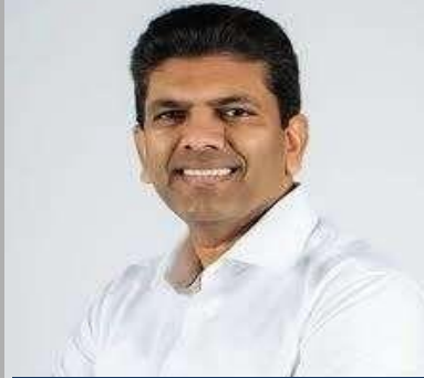
Hon'ble Minister of State Dr. Pemmasani Chandrasekhar