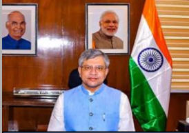
Shri Ashwini Vaishnaw Cabinet Minister