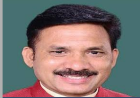
Shri Devusinh Chauhan Minister of State